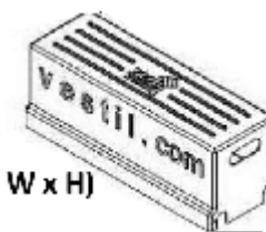
REMOTE POWER UNIT 32 1/2" x 12" x 12 1/2" (L x W x H) WITH 8' HOSE & CABLE