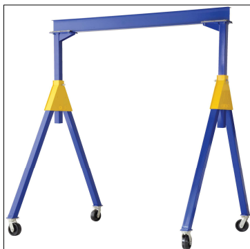
Fixed Height – Model: FHSN