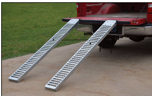
Steel Pick-Up/Van Ramps