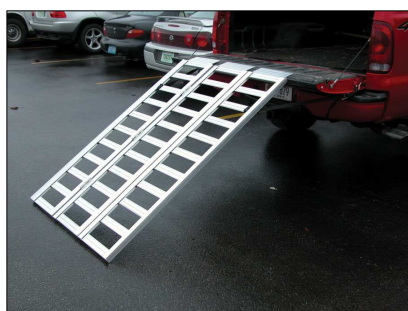
Aluminum Pick-Up/Van Ramps