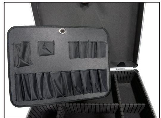
Removable Back Piece