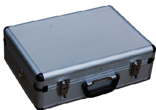
Aluminum Tool Case