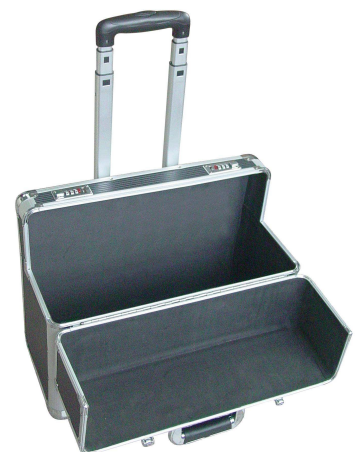
Inside of the CASE-SH