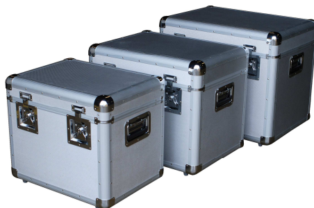
Aluminum Storage Cases