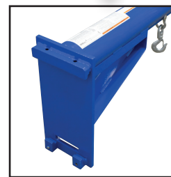
Class II Carriage Mount