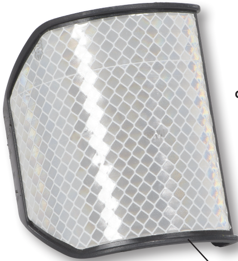
Model Shown: GR-H2R-RFT-WT