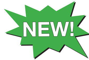
Add To New Or Existing Guardrail