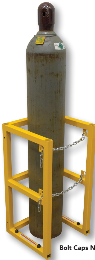
Bolt Caps Not Included