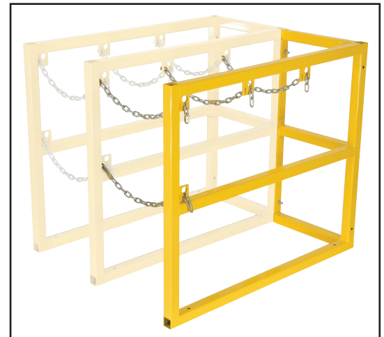
Model: CYL-FMSR-3-EXT Shown attached to CYL-FMSR-3