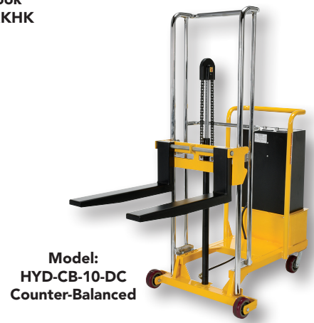
Model: HYD-CB-10-DC Counter-Balanced