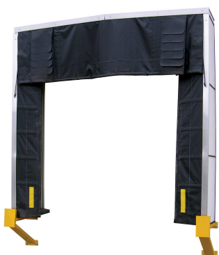
Dock Seals and Shelters