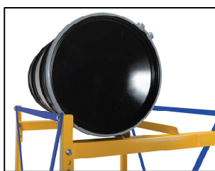
Extra height uprights keep drums from dangerous roll off

Constructed of heavy duty steel angle Cross bracing is provided for extra strength Allows forklift entry from the front or rear Uprights keep drums from accidental roll off