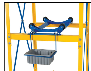
Optional Revolving Drum Cradle & Drip Pan

Available in FIVE different configurations!