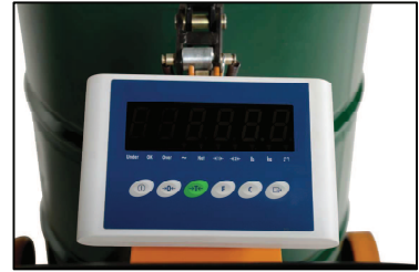
Scale Head with Automatic Turn-off