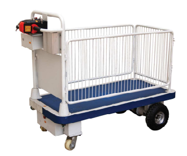
Powered Platform Truck