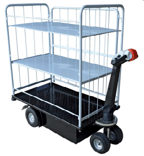
Traction Drive Carts