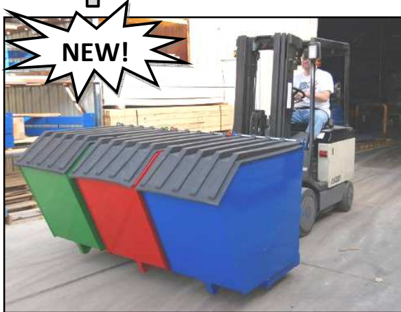
All 3 bins are attached to one base!