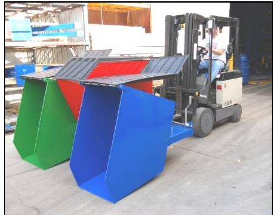
Each bin may be dumped independently!