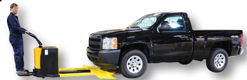
Shorter Turning Angle when Ride-on Platform is Used