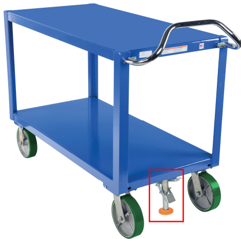
Cart shown with FL-LKL-5