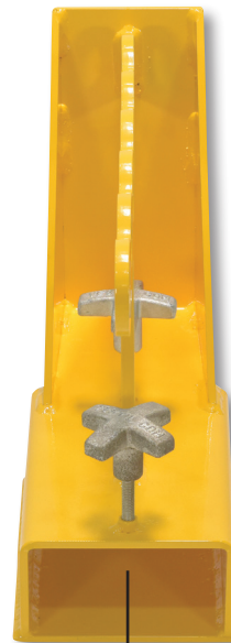
5½"W x 3"H Usable Fork Pocket