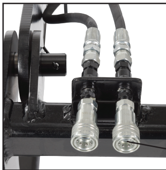
Connects to and Functions by Fork Truck's Hydraulics