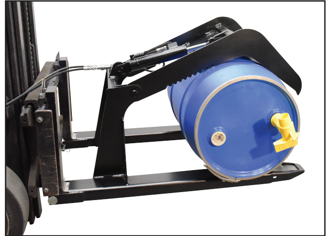
Helps Secure Round or Oversized Items