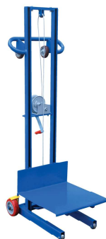
Lite Load Lifts