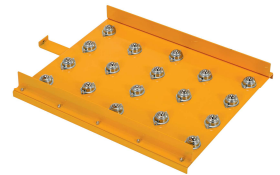
Ball Transfer Platform