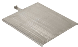
Stainless Steel Platform