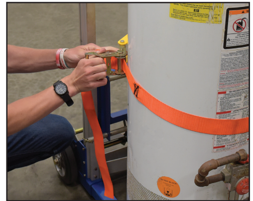
Ratchet Strap Helps Secure Tank