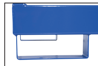
BUILT IN FORK POCKETS