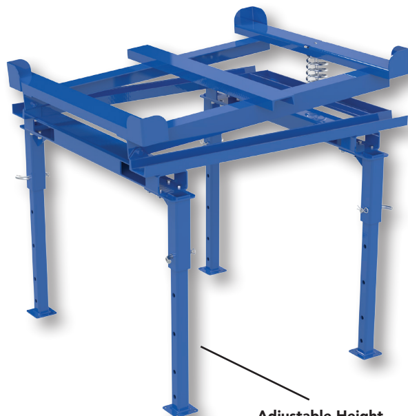
Adjustable Height Five Levels in 6" Increments