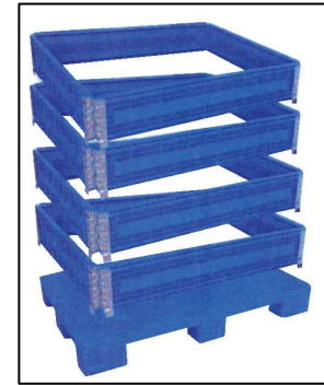
Individual Sides are 8\"H