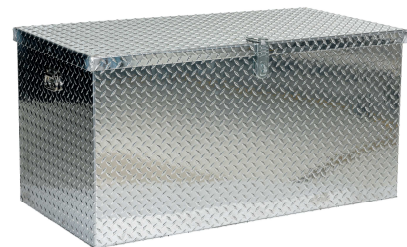
Aluminum Tread Plate