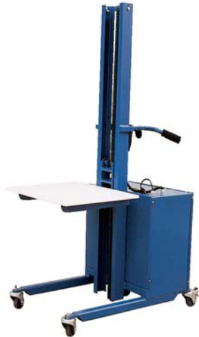
PEL Steel Quick Lift

These quiet, lightweight units transport and position loads quickly with just the push of a button. These DC powered units feature a low profile design for maneuvering in narrow aisles and confined spaces. Optional equipment available include a detachable hand held control and a programmable height index.