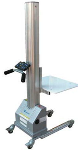
PEL-A Aluminum Quick Lift