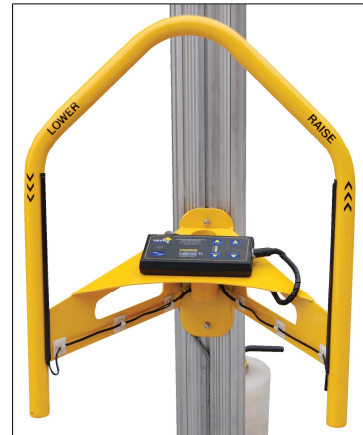
Electric touch sensitive controls

Provides the flexibility to apply stretch wrap film at any workstation!