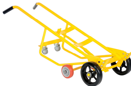
Multi-Purpose Drum Truck/Cradle