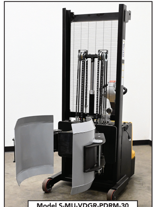
Model S-MU-VDGR-PDRM-30 Shown On Model S-MU-VDGR-64