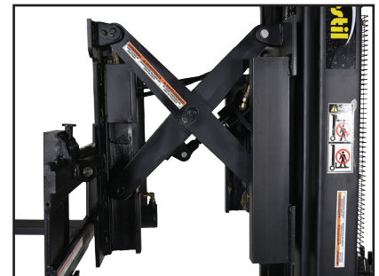
Powered Fork Reach