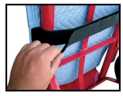
Easy to install

Feel free to contact me for additional marketing information, discounted pricing or digital images.