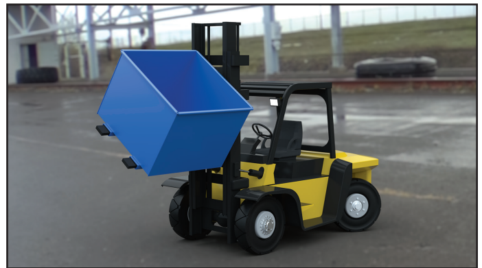
Use in Conjunction with a Forklift Rotator