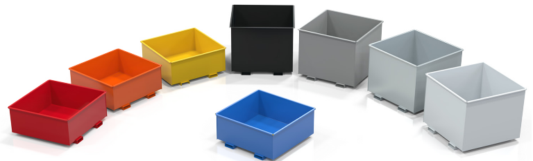
Additional Color Options Available