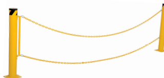
Chain Bollard Barriers