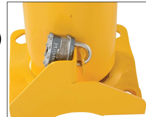
Secure gate open or closed