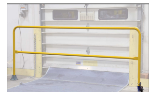
Safety Swing Gates