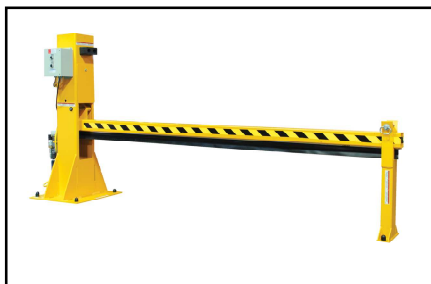
Dock Barricades (Electric/Hydraulic & Winch)