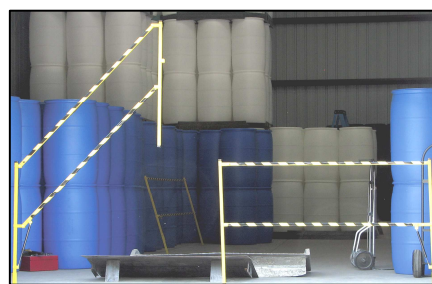
Safety Lift Gates (Single & Double Wide)