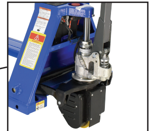
Quick Lift Pump