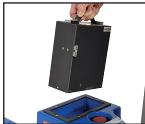
Quick Change Lithium Battery Pack