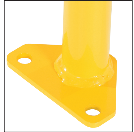
Each Baseplate has Two Mounting Holes