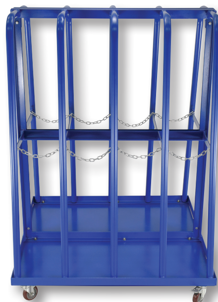
8 Storage Bays; 4 Bays on Each Side