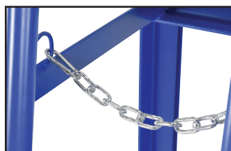
Restraint Chain with Snap Hooks on Each End