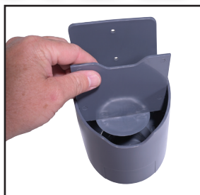
MODEL FTA-P-SWC INCLUDES STORAGE DIVIDER

ATTACH TO THE EXTERIOR IN ANY PREFERRED POSITION