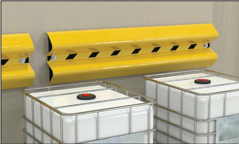
Mounting Hardware Included (Rail to Bracket)